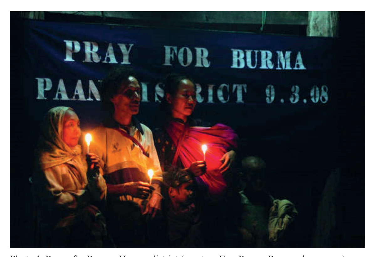
Photo 1: Prayer for Burma, Hpa-an district

Some local relief organizations and Christian missionary and humanitarian agencies such as the Free Burma Rangers conflate missionary and humanitarian goals and operate beyond the legal framework; crossing the border illegally in coordination with the Karen National Liberation Army (KNLA) troops to intervene on behalf of Karen villagers whose houses are burned and destroyed by the Burmese army.