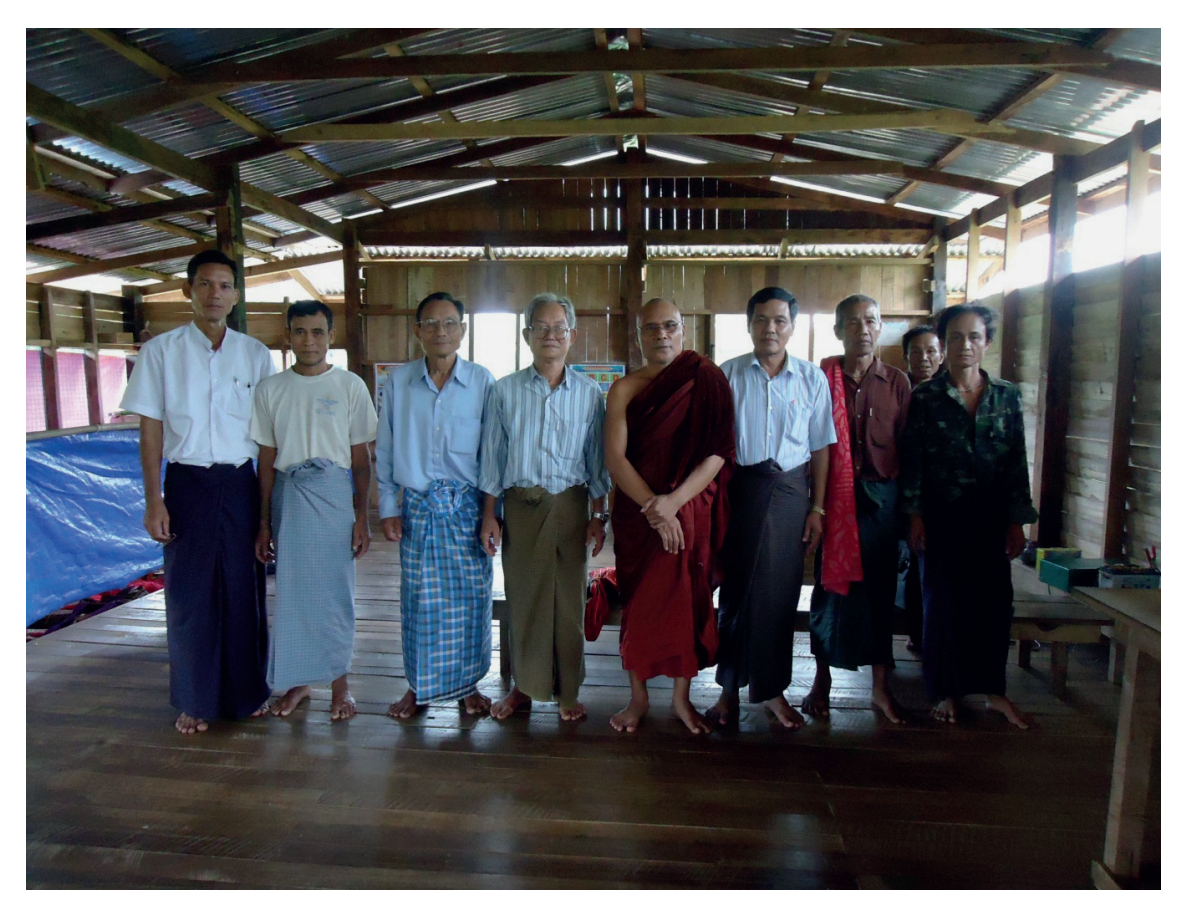
Photo 2: Together for a better Future? Religious and Community leaders in Karen state

favor individualism and freedom of speech etc., while the Karen notion of culture includes a system of beliefs that center on the cosmological values of the community and on the relationship of humankind with the environment and the cosmos (Hayami 2004). Karen culture is largely synonymous with the imagination of a just and moral order, but while this focus on customary law is encompassing, the different local religions have established different belief systems governing everyday life and social relations in the community. The different communities are now building alliances with different actors, including the KNU, charismatic Buddhist monks, American Christian missionaries, international human rights organizations, UNESCO officials, and local Karen human rights organizations. Communities that become affected by the ongoing fighting disintegrate and reintegrate, and are divided across distances and across the Thai-Burma border. In the contestation of competing descriptions of Karen cultural traditions, religion plays a central role as a social need, a base of social solidarity and political aspiration.