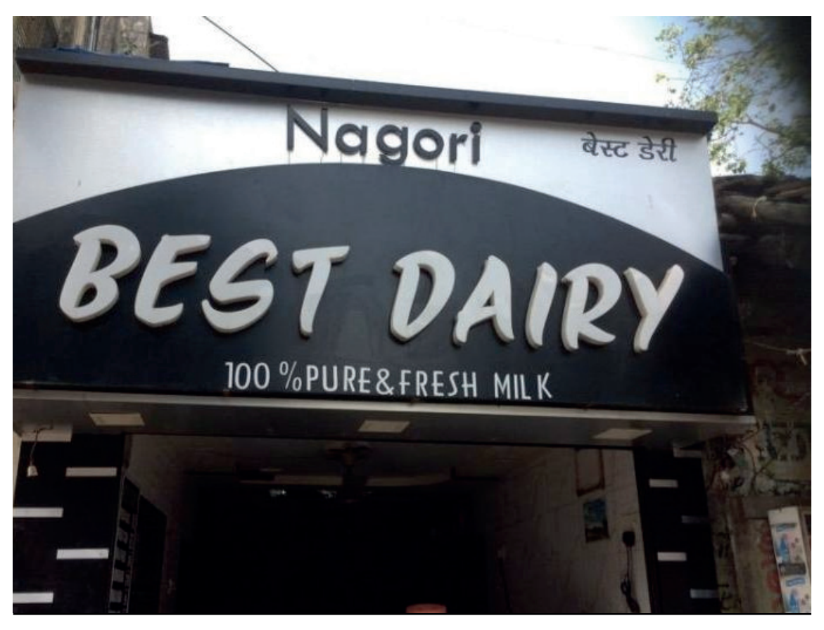
Figure 2: Nagori Dairy

Given the infrastructurally mediated nature of urban space, how short (in time or distance) must distance be – and how often must travel between two territories take place – before the two can be conceptualized as part of a single 'city?' Take, for instance, the smallish city of Nagaur in western Rajasthan, situated about 1100 km from Mumbai. While the censused population of Nagaur is around 100,000, the size of the Nagori community is estimated (by Mumbai-based Nagoris) at around 20,000. That is to say, a large percentage of Nagori households have one or more of their members working in Mumbai. Many Nagori Mumbaikars are married men who spend a few months at a stretch in Mumbai, where they live in modest accommodations and send much of their earnings back to their families (parents, wives, children) in Nagaur where families invest in land, education, and ever-larger houses. By overnight train from Mumbai's railway terminus, Nagori men (and sometimes women) move back and forth from Nagaur in around 17 hours. Most Nagori men I know make the journey every six weeks or so, to visit with mothers and wives and children. Some women join their husbands in Mumbai – an arrangement that is generally worked out among the brothers of an (extended family) household: one wife